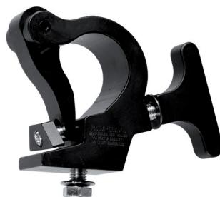
Mega-Claw Black Anodized

Safe Vertical Working Load (lbs) 1,100 lb