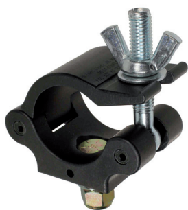
Mega-Coupler 1/2" Hex Head Bolt With Steel Wing Nut Black Anodized