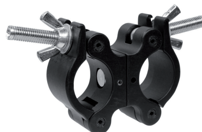
Mega-Coupler, Swivel Steel Wing Nut Black Anodized

Safe Vertical Working Load (lbs) 1,100 lb