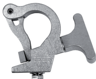
Mega-Claw Aluminum Finish

James Thomas Engineering partners with The Light Source to bring customers the most innovative products. Light Source Mega-Clamps have shipped all over the world.