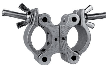
Mega-Coupler, Swivel Silver

Safe Vertical Working Load (lbs) 1,100 lb