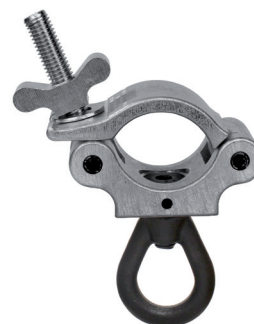
Coupler with Eye Nut, Silver

Safe Vertical Working Load (lbs) 1,100 lb